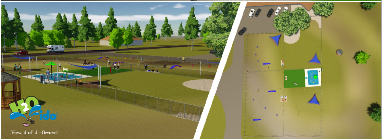
View 4 of 4 - General