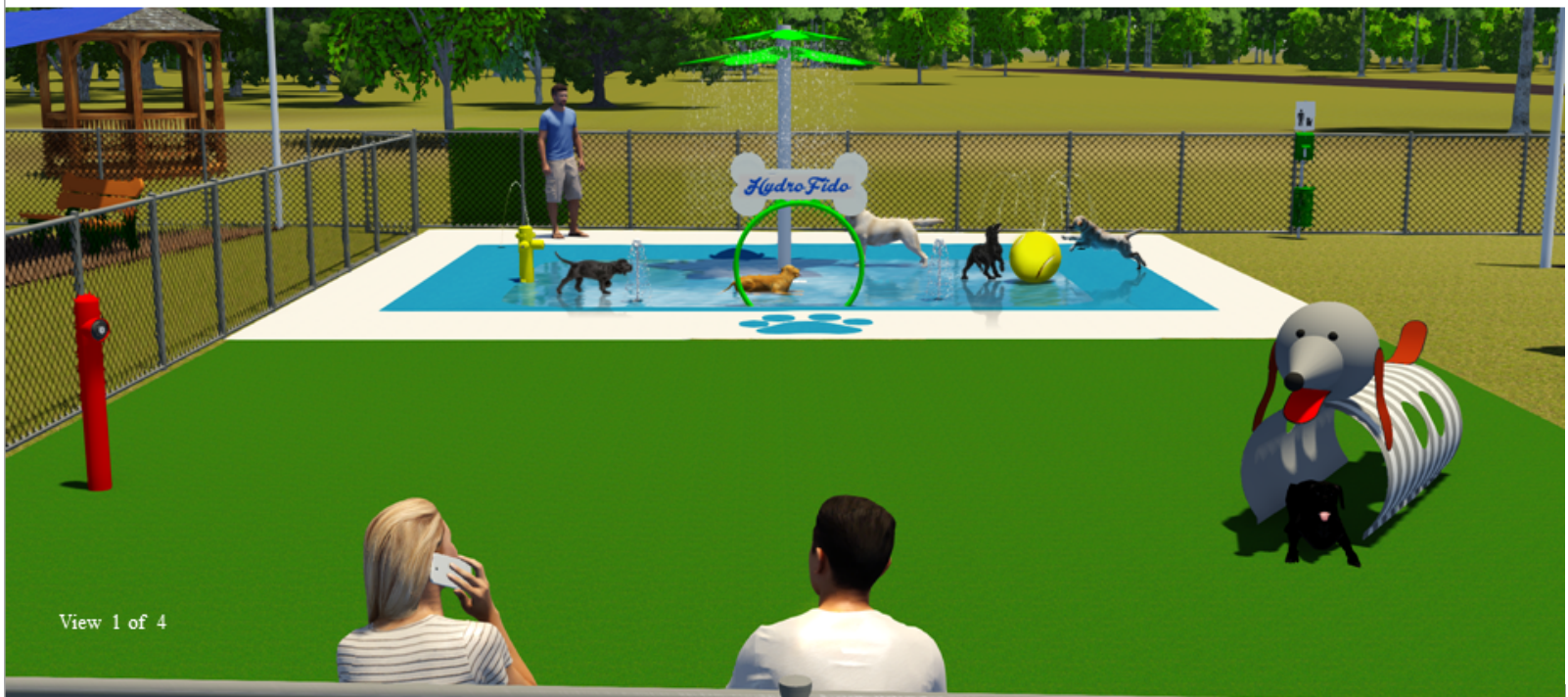
View 1 of 4