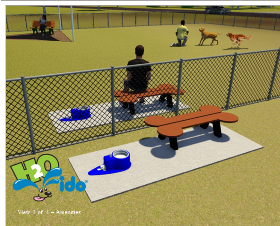
View 3 of 4 - Amenities